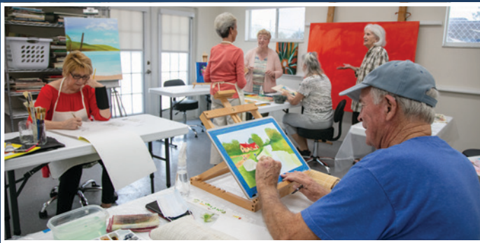
Get creative with fellow artists in the Art Center