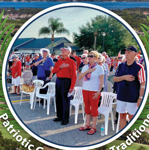
Patriotic Ceremonies & Traditions

“We’ve finally found the place that we can call home.”