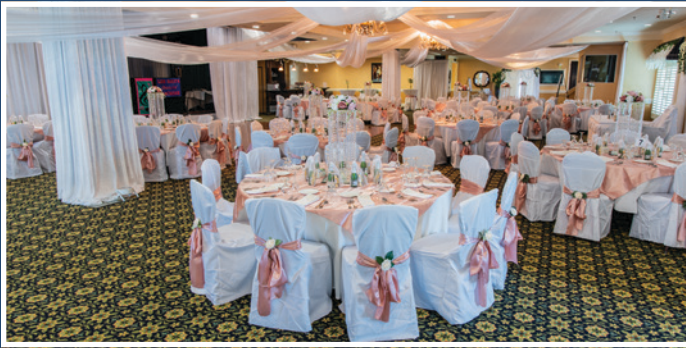
Colony Hall - A wonderful venue for events