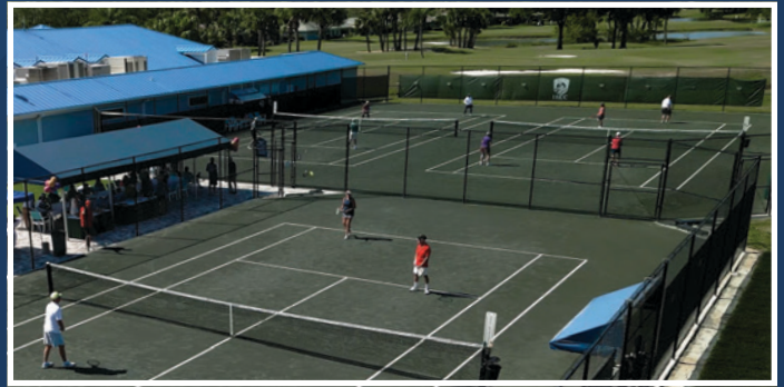
Serve it up! - 3 Har-Tru Tennis Courts