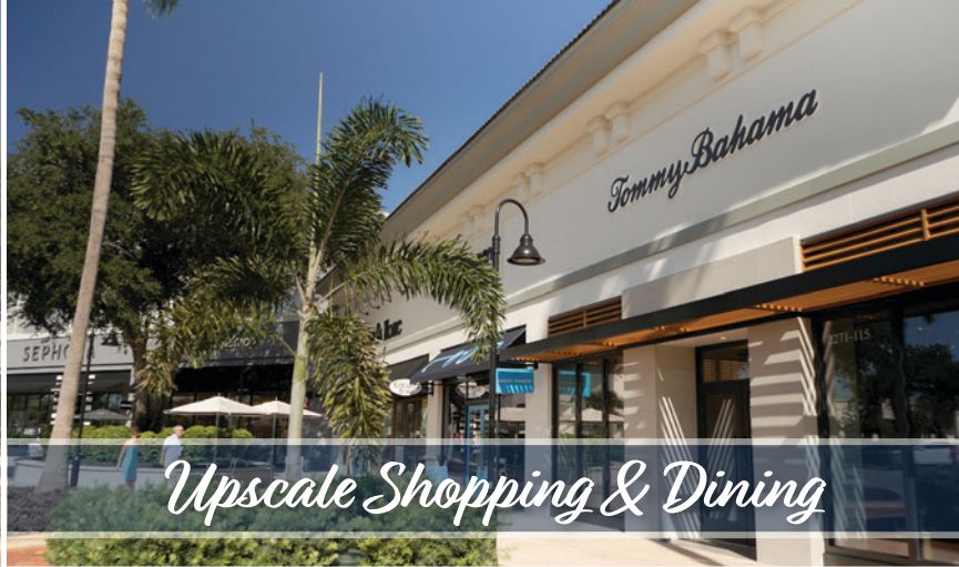
Upscale Shopping & Dining