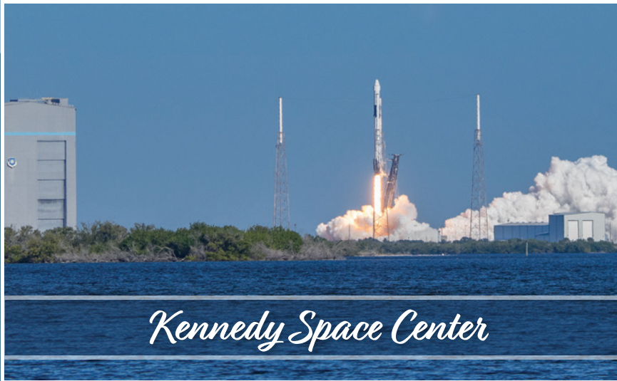
Kennedy Space Center