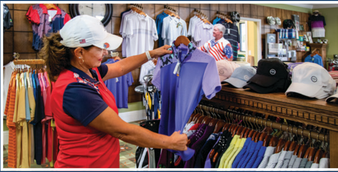
Shop for gear or book tee-times at the Pro Shop