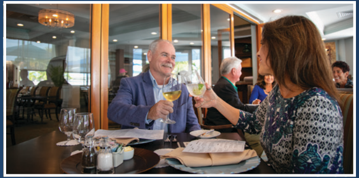
Enjoy casual & fine dining at the At Ease Club