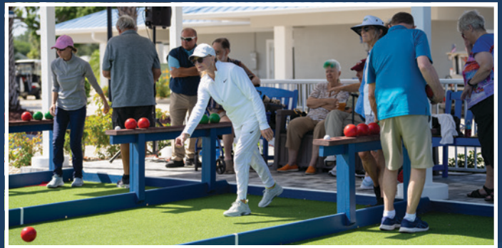
Enjoy leisurely outdoor activities with friends

“ We are truly delighted to be part of the paradise of IRCC. ”