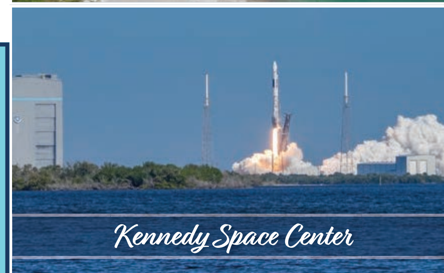
Kennedy Space Center