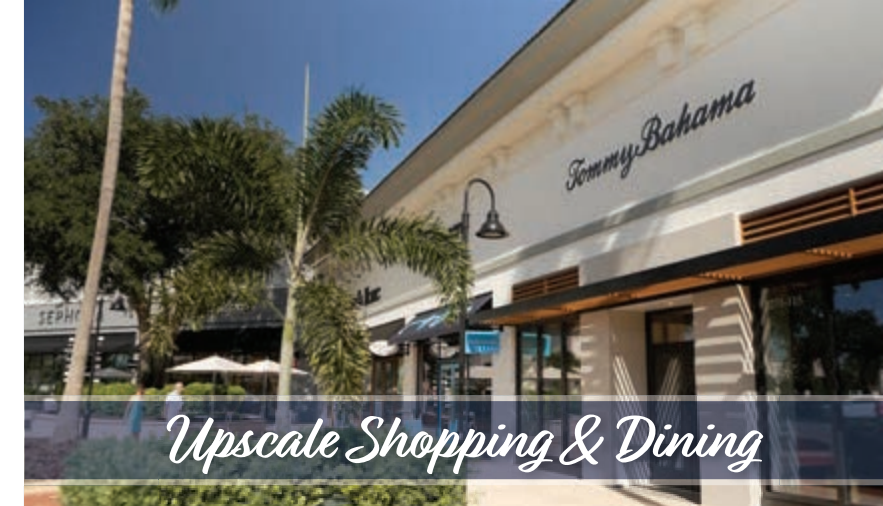
Upscale Shopping & Dining