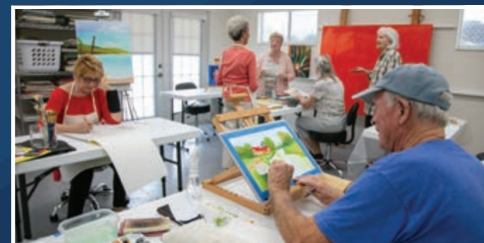
Get creative with fellow artists in the Art Center