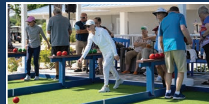
Enjoy leisurely outdoor activities with friends

“We are truly delighted to be part of the paradise of IRCC.”