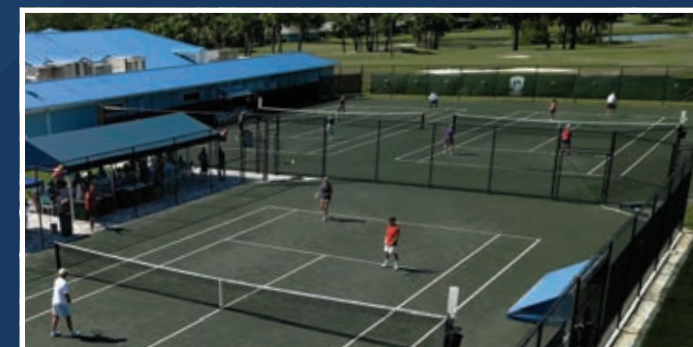
Serve it up! - 3 Har-Tru Tennis Courts