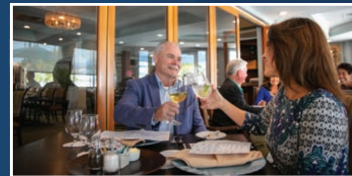
Enjoy casual & fine dining at the At Ease Club