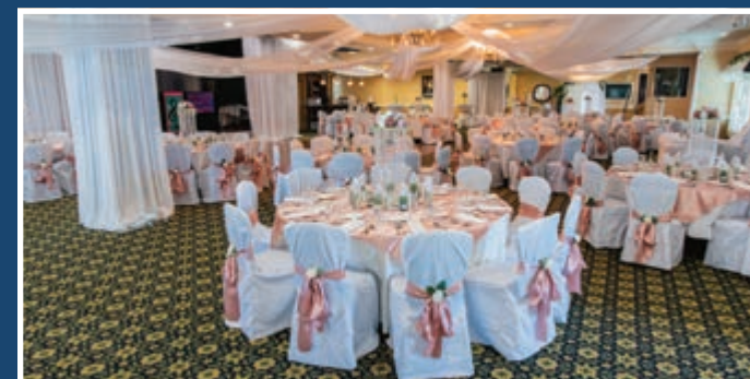
Colony Hall - A wonderful venue for events