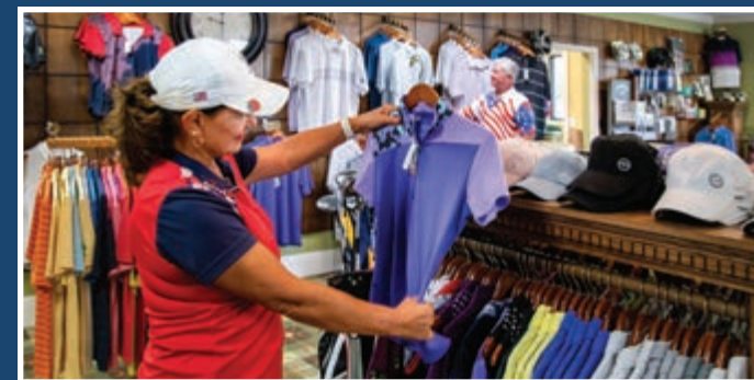
Shop for gear or book tee-times at the Pro Shop

Colony Hall is a separate building near the At Ease Club. This venue hosts many activities including plays, choral productions, military balls, banquets, community or private parties, and weddings. Seating over 200 guests, Colony Hall is also a busy community center used for numerous activities and events such as non-denominational chapel services, wellness classes, card games, piano bar, and club meetings. It houses a lending library with many donated books for members' reading pleasure.