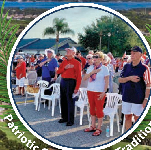
Patriotic Ceremonies & Traditions