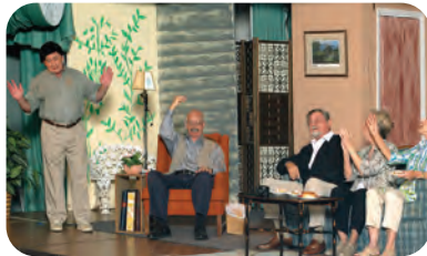
Cart Barn Players Theater Group