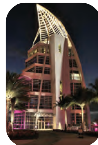
Exploration Tower at Port Canaveral

The Space Coast is home to many large events, festivals and culture with so much to see and do. Visit the Space Coast of Florida website to learn more about this perfect location: VisitSpaceCoast.com