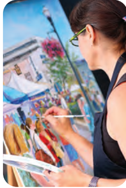
Art Group & Classes