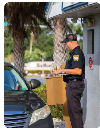
24 Hour Staffed Security

Convenient access to: • Upscale Shopping • Hi Tech Industries • Beaches • Patrick SFB • VA Clinic • Kennedy Space Center • Port Canaveral • Colleges • Many Cultural Attractions